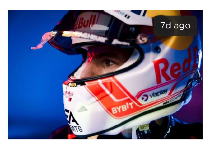
Max after first miles in the RB19: 'Exactly Verstappen.com launches Official Oracle